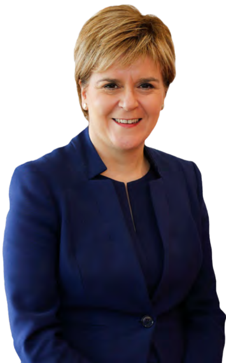
Rt Hon Nicola Sturgeon MSP